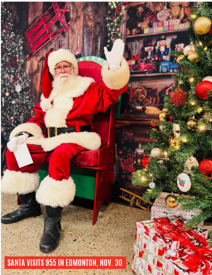
SANTA VISITS 955 IN EDMONTON, NOV. 30

Oosita is committed to sustainable growth, protecting the interests of future generations and shaping the destiny of the Métis people.